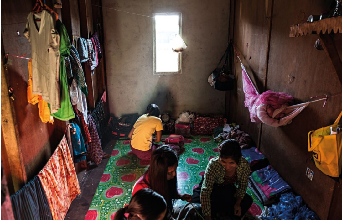
Garment factory workers prepare food in their small dormitory room in Yangon, Myanmar.