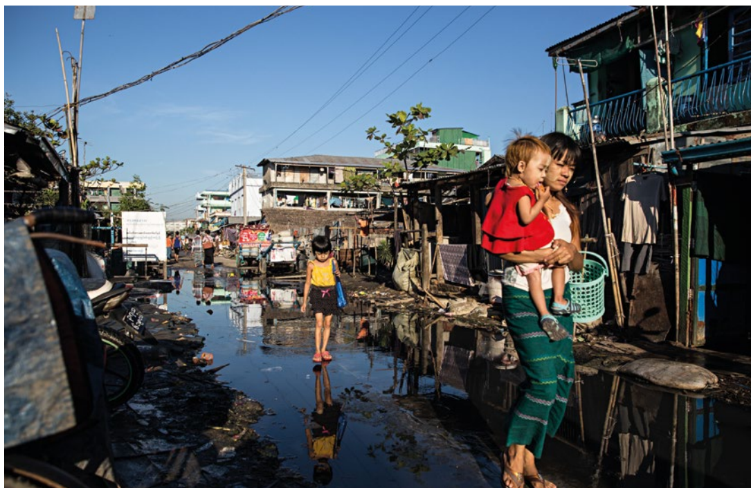
A woman and children walk down the flooded streets of Yangon's Hlaing Tharyar industrial Zone, an area that houses many garment factory workers.

Moreover, the current administration relies heavily on civil servants who served under the previous government – including, for example, the Director General and the Secretary of the Ministry of Labour. District and township level dispute handling bodies are also still run by civil servants who have been in post since the days of the military regime.